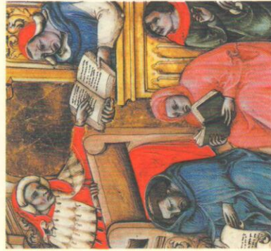
15th-century painting depicting a group of men in 15th-century attire seated around a table, engaged in a formal discussion or conference.

CONCLUSIVE REMARKS OF GROUP DISCUSSIONS (WITH A VIEW TO DRAFT A REPORT TO BE PRESENTED TO THE MINISTERS ON JUNE 19)